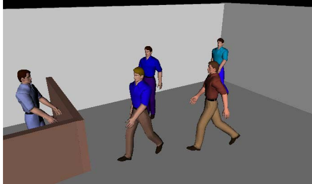
Figure 3: Screenshot of the environment

mechanism to ensure that the agents will follow their path without being blocked by other static or animated agents. An agent can perceive each entity (object or agent) that is visible by it and lies within its perception distance and angle.